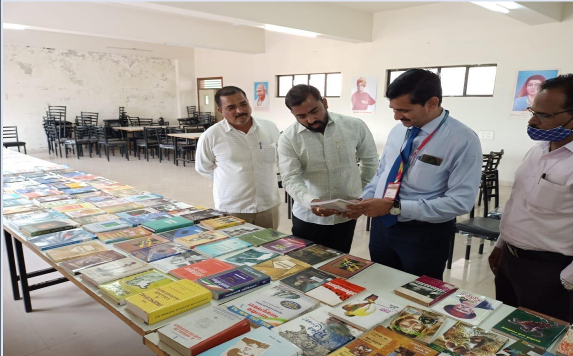
Photos showing the occasion of Dr. A.P.J Abdul Kalam Jayant & “Awareness of Vachan Prerena Din.”